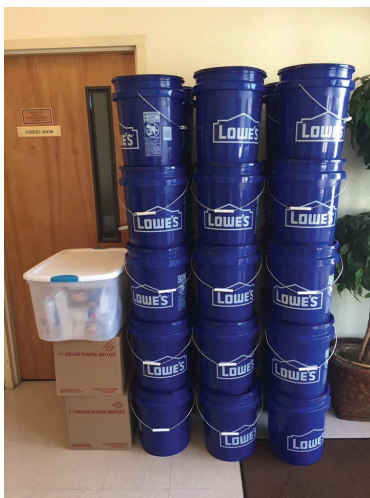
The men from Fairview FWB Church, Spartanburg, brought themselves and cleaning supplies donated for 'Blessing Buckets' so they could help with the SCFWB Disaster Relief efforts.