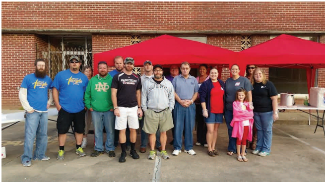
Temple FWB church Darlington, provided breakfast for over 150 people affected by hurricane Matthew.