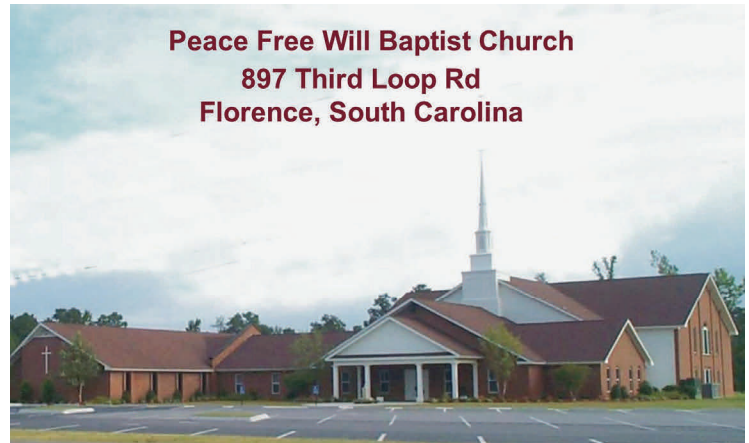
Peace Free Will Baptist Church 897 Third Loop Rd Florence, South Carolina

(From the State Constitution- "Representation to this association shall consist of delegates duly appointed or elected by the local church (2) and local conference / association (5), all ordained and licensed Free Will Baptist ministers, and all members of standing boards or committees, who are of a good report in their church and conference / association of which they are members." )