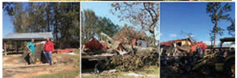
The SCFWB Disaster Relief Board did numerous assistance projects in the aftermath of Hurricane Matthew

John 13:35 By this shall all men know that ye are my disciples, if ye have love one to another.