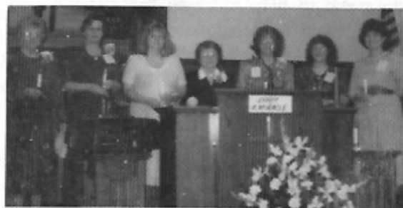
Newly Elected Officers

Congratulations are in order for the ladies at Valley Falls. They did a tremendous job hosting the event. It was evident that a lot of hard work went into planning, preparing, and decorating.