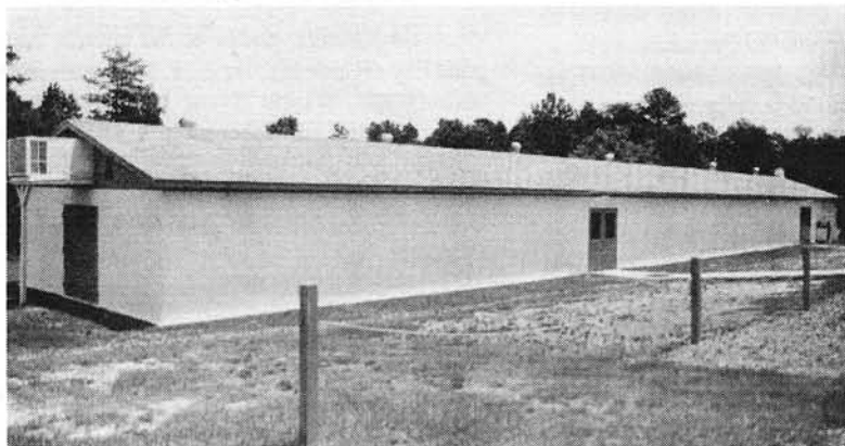
Exterior Of Building Before Steeple And Canopy Was Installed

ceiling refinished. New carpet was installed on the floors.