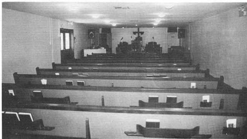
Interior View Of New Vision's Sanctuary