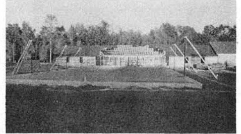
Mullins-Marion FWB Church, Mullins, SC is in a building program that will greatly increase their facilities. The building to the far right is the newly completed fellowship hall. The center back facility under construction will be additional educational space. The concrete slab in the immediate front will be their new sanctuary.

weight. Patsy Hyman, the pastors wife, is a little sneaky. She slipped out of the sanctuary and soon returned pulling a small covered wagon with the words, "Wells Fargo For Missions". When she placed her coins on the scale it shifted positions in favor of the ladies. The men must have been more sneaky than Patsy because in the evening service the men placed more coins in their bucket, so much that the scale not only dipped in their favor, but the weight of the coins was so heavy the pipe holding the buckets broke. All of the coins weighed in at 333-1/2 pounds. When all gifts were counted the total was $1,000.00. This congregation is to be commended for this remarkable success.