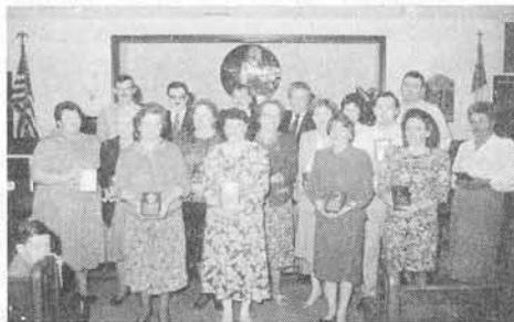
Gilead Bible Readers