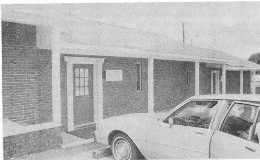
Current Meeting Facility