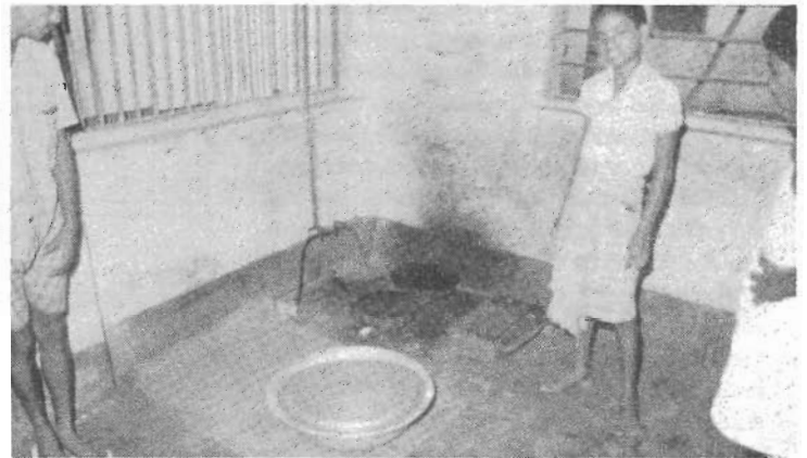
This Is A Cooking Area In Addition To The Above One. This Is A Gas Burner. The Gas Is Supplied From A Reservoir To The Rear Of The Hostel. The Gas Is Formed Through A Process Of Animal Dung And Water.

Of course, the children receive the needed physical care, but the purpose of the hostel is far more reaching than this. The children are won to the Lord and receive extensive training in the Word of God. A part of their spiritual training is in stewardship. They are taught that work is a vital part of the Christians life and they get practical training by doing their own cooking and all the other chores involved in keeping the hostel. They have devotions and Bible study each day in addition to special classes. Their academic education is received through the local public school and classes at the hostel. The ultimate goal in all of the training is to raise up spiritual leaders for the churches. Six of the North India ordained pastors received their training there. Two young men are now in Bible College, in Calcutta, who completed their school work in the hostel. Several deacons and all of the men who lead church services when pastors are not available have had their training in the hostel.