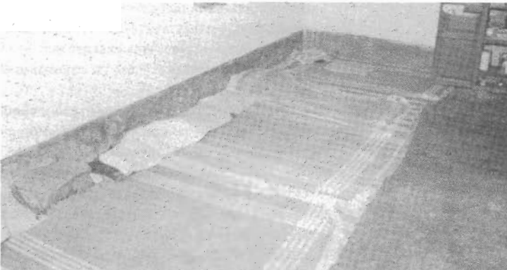
Scene Of The Bedrooms. The Beds Consist Of A Blanket On The Concrete Floor And A Small Pillow. There Is Very Little Furniture. Clothing And Other Items Are Kept On Shelves.