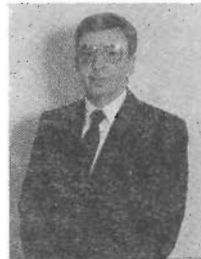
Evans To Freedom

We extend a hearty welcome to the Bell's on their return to the Eastern Conference and our State.