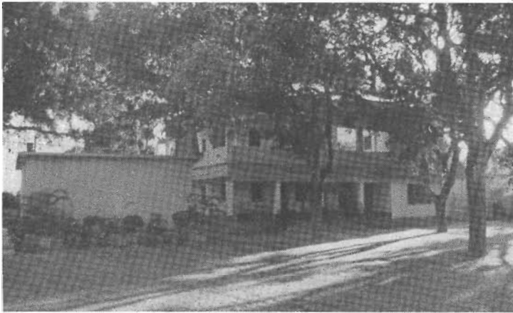
The Hostel Building That Now Houses 35 Children. It Is A Two Story Building Constructed of Concrete With Porches On Each Floor That Extend Completely Around The Living Area.