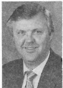
Bell To Mill Branch

This is an excellent opportunity for preachers to gain a greater insight to the value of Expository Preaching and to get some practical helps on how to do it. If preachers would travel in groups and lodge together on campus the cost would be nominal.