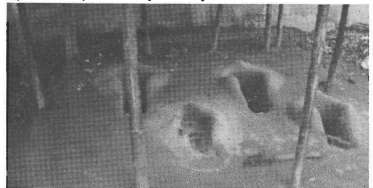
This Is A Scene Of The Cooking Area (Kitchen As We Know It). Where Most Of The Cooking Is Done. It Is To The Rear Of The Hostel In An Open Area With A Grass Roof Held Up By Bamboo Poles. There Are Four Holes In The Ground Which Are Lined With Cement. A Fire Is Built In The Hole And The Cooking Containers Are Placed On Top.

The children come from Christian homes and range in age from very young through completion of high school. The children are those who need the care given and have no other means of education. The boys live in the home 12 months each year. They go to visit with their parents in their homes a few days out of each year and their parents are permitted to visit them in the hostel.