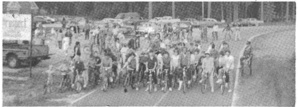
Bike Riders Awaiting The Signal To Begin The 20 Mile Course.

thirty three years later, on a cross, when Jesus died for our sins.