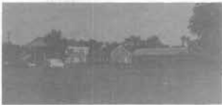
Administration—Recreation Building Girls Dormitory