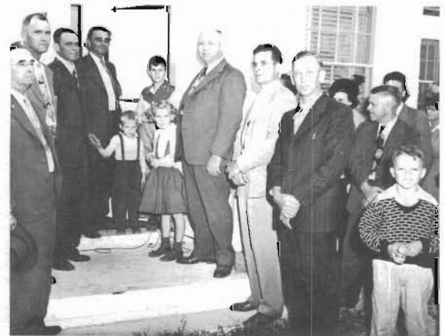
The Original FW Baptist Childrens Home of 1949