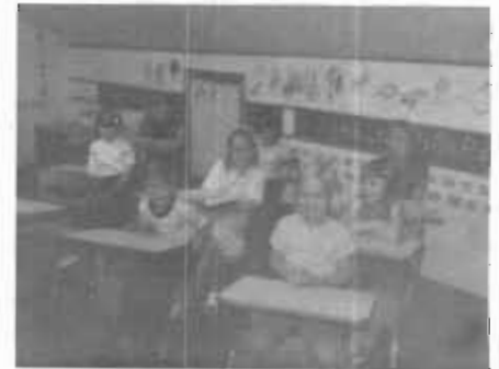
Grades 2-3-4 Classroom