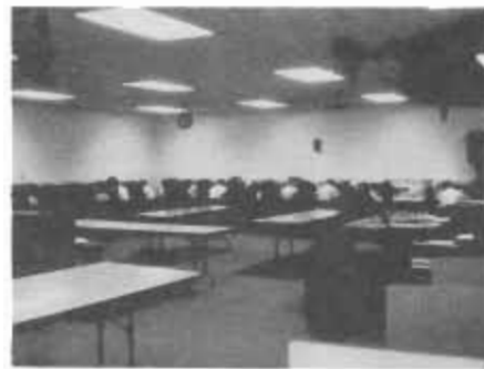
A.C.E. Learning Center