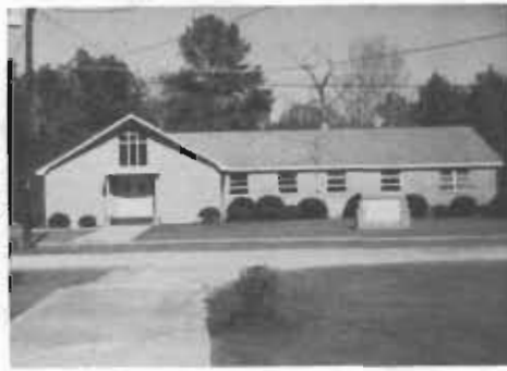
Grace Building Before Addition

Thus, giving with simplicity is giving from an open heart: no secret motive hidden, and no selfish restraint to hinder free response to the needs of others.