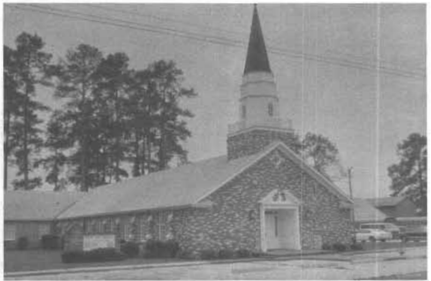
New Prospect F.W.B. Church and School Facilities