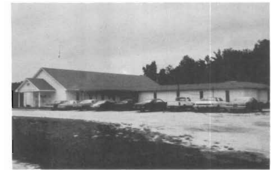
Mullins-Marion F.W.B. Church and School Facilities