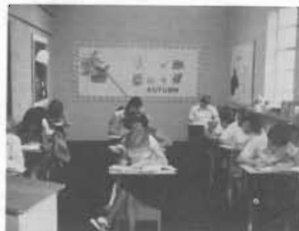
Grades 7-8-9-10 Classroom