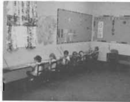
Child Day Care Center