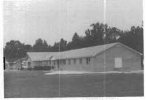
Grace Facilities With New Addition And Parsonage