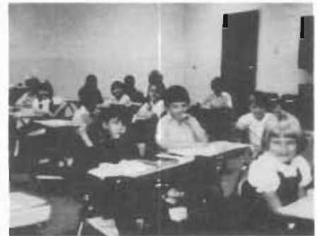
Grades 1 & 2 Classroom