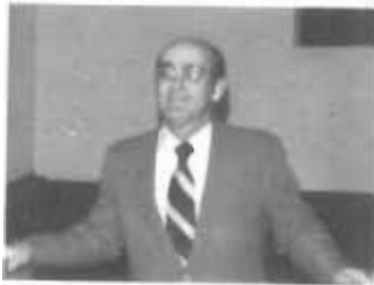
From The Editor

TIME IS FLEETING: Yes! Time is rapidly passing and this year is fast coming to a close. This is the 5th issue of "The Informer" with one more to be published in this year. Shortly after the next issue it will be State Convention time. I am looking forward to this meeting and I hope many of you will begin now to make plans to attend. It's a great time of spiritual refreshing from the preaching, singing and fellowship. An excellent program is in the making, so folks, let's go.