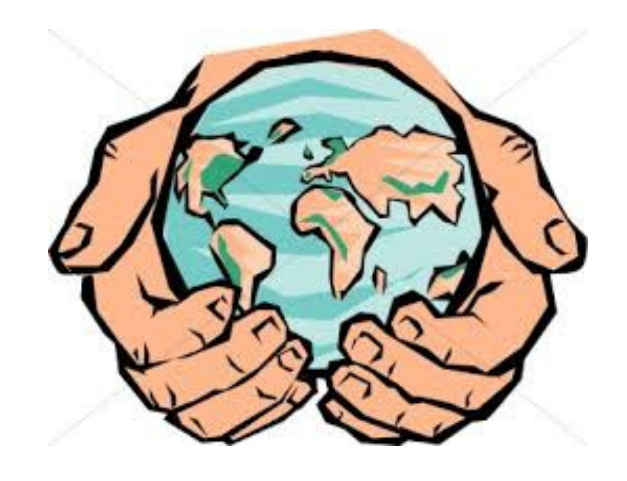
Mark 16:15, "go ye into all the world,"

74th State Association Meeting February 25-26, 2016