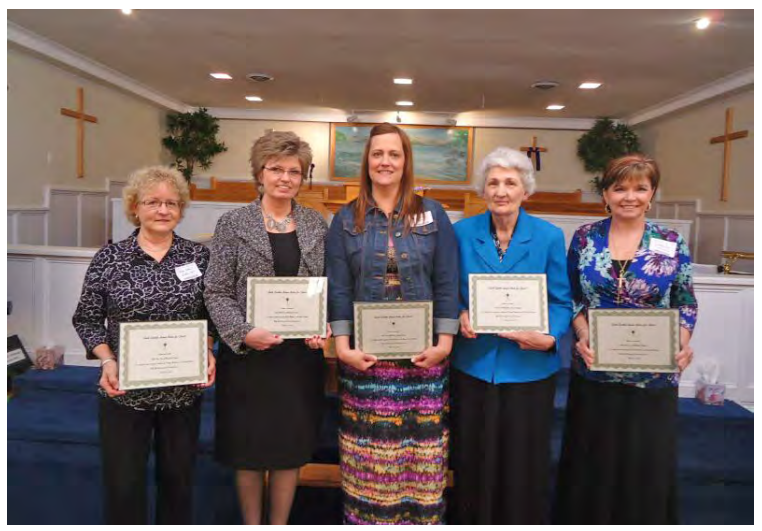
SC WAC Recognitions for Top Giving Churches at the SC WAC State Meeting - March 15, 2014