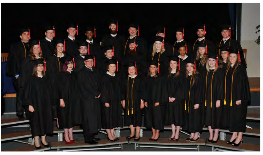
Vol 44 Num 1 Spring 2014 Page 11