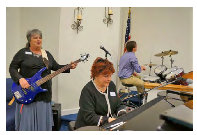
Turning Point FWB Church Musicians Providing Special Music During the SC FWB State Meeting