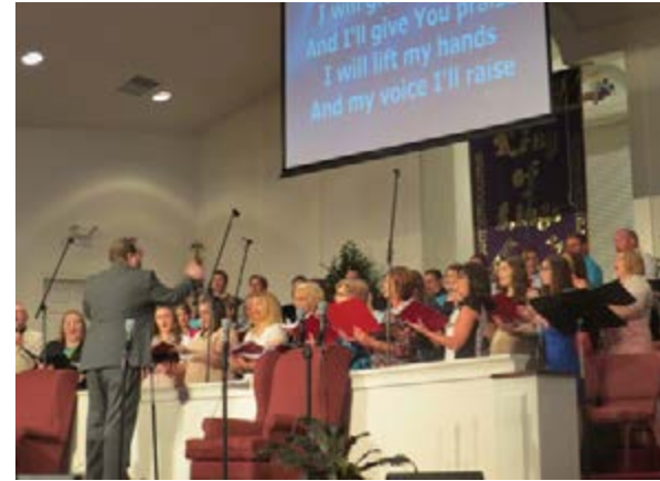
Peace's Choir gave a beautiful performance with several great songs.

Peace Free Will Baptist Church (Florence) recently celebrated 30 years of ministry to The Lord with several people who have gone out in service to The Lord coming back for this grand celebration. There were great crowds, beautiful music and powerful preaching!