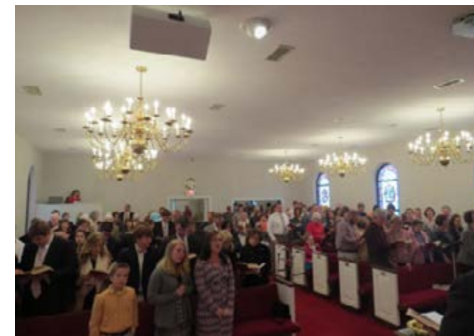
Great Crowds that day!