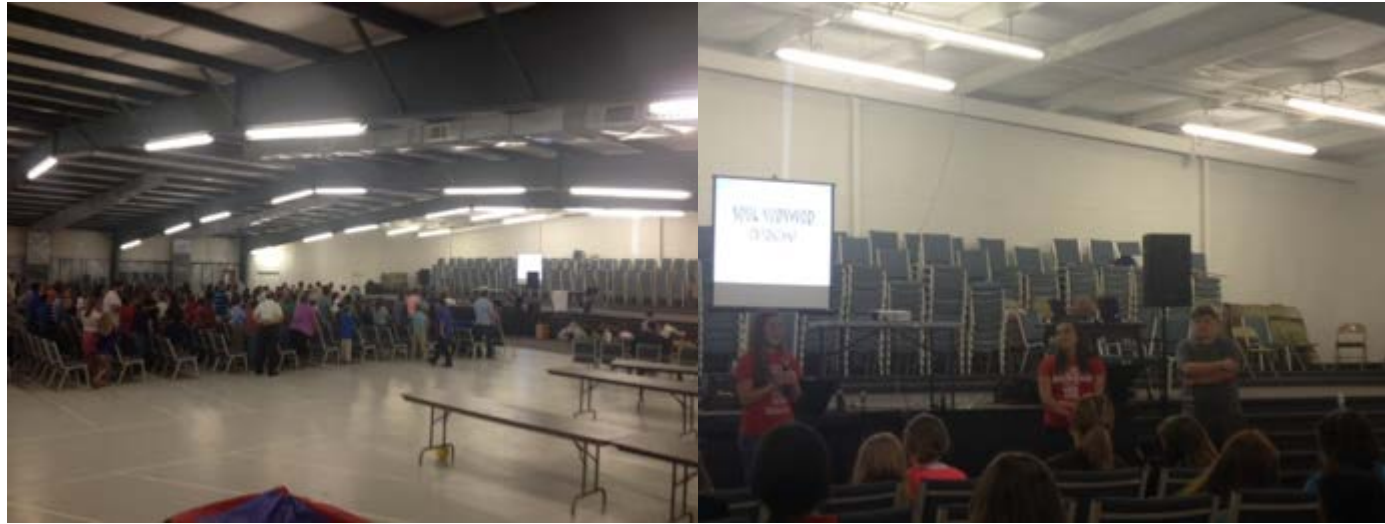
(Great Crowds attending Services at Youth Camp)