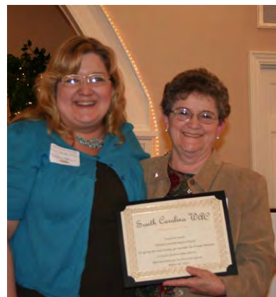
Pictured Left and Right: Temple FWB Church receives the award for the most giving to Foreign Missions per member as a member of the SC Conference District, and they also receive the award for the most giving overall in the state based on the most money per average member.