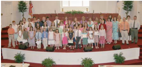
Pictured Above: CTS Competitors, Officers, and Judges at Peace Church. Note: Some competitors not pictured.