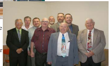
Pictured Right: Some of the True Life Ministers in attendance at the 20th Year Celebration