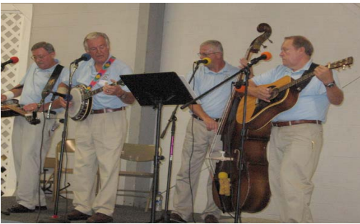
(Pictured Left: Trinity Bluegrass provides special music for the event).