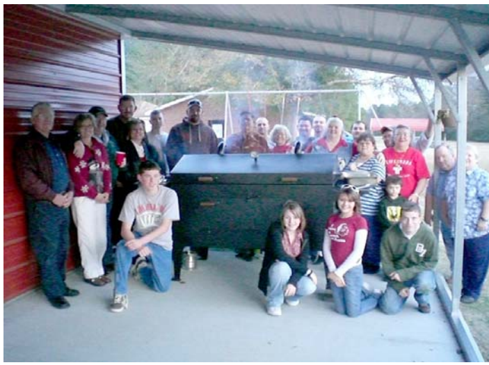
Free Welcome Celebrates 48th Anniversary