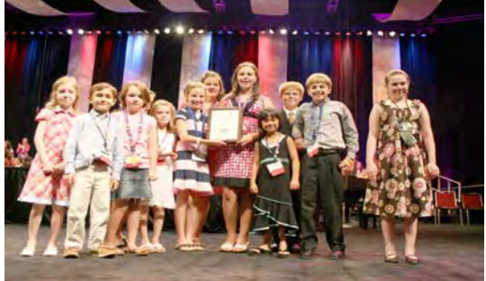
Horse Branch Choir, Turbeville Category B - 1st Place