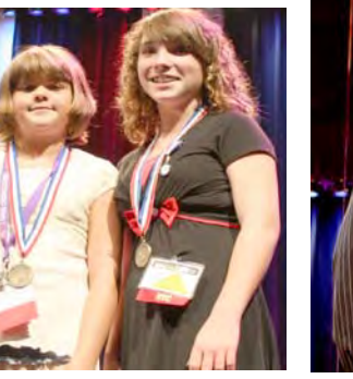
Bay Branch, Timmonsville Dramatic Duo Category B - 1st Place