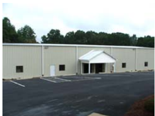
Jackson Family Life Center