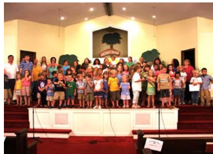
Horse Branch VBS attendees and workers after the Friday evening program