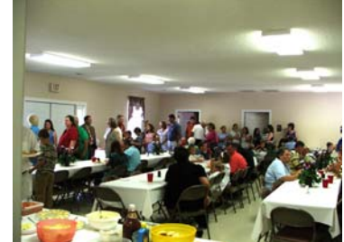
Enjoying a delicious meal after the dedication service