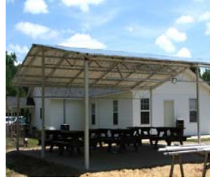
Educational Wing and Picnic Shelter