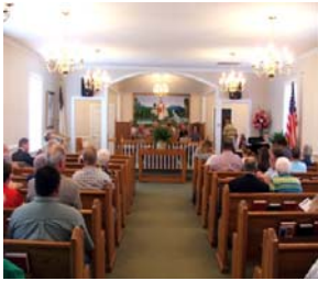
Newly Renovated Sanctuary