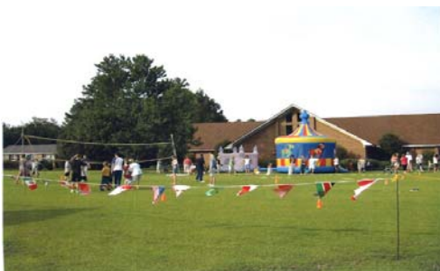
Harvest Fun Festival