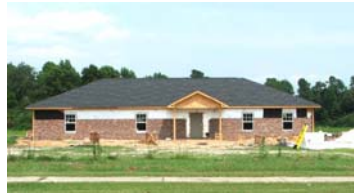
Partially Bricked with Doors, Windows, and Sheet Rock on the inside