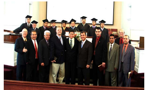
GHHI 2007 Graduating Class, Professors, and Commencement Participants