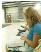
God & I Time

kids return, and I can't wait to see some new faces, hopefully from churches that did not send kids to camp this year, so that they can also share in all the great experiences with us."