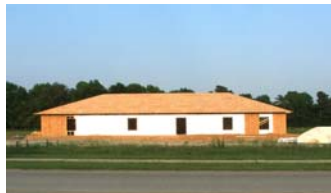
Framed and Roofed