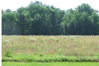
Land Adjacent to Children's Home Director's House before Construction Began

In the month of May, preliminary plans were approved by the Town Council in Turbeville. At the beginning of June, construction began on the new Free Will Baptist State Office. A good amount of progress has been made thus far with the construction. If things continue to progress, hopefully, the new state office can be occupied some time during the fall of this year. Below are some pictures showing the progression of the construction: