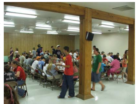
Everyone enjoyed the great meals and the nice facilities this year.