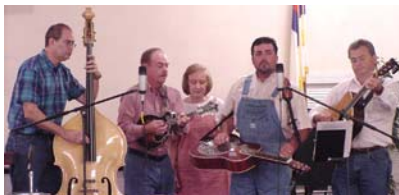
Special Music provided by Crystal River

Calvary FWB Church, Georgetown had a three fold celebration on Sunday, June 12th. They celebrated Home Coming, Old Fashion Day, and Building Dedication for their remodeled Church all on the same day. Many people wore "old fashion" clothes, milk pails were used to receive the offering, the communion table flowers were in a tin tub, and pictures of past services were on display.