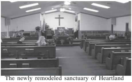
he newly remodeled sanctuary of Heartland FWB Church

when they arrived on Sunday, December 5th. New carpet was installed, the pulpit area was remodeled with new altars installed, and a new baptismal