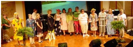
The Friday Night Palmetto Fashion show was enjoyed by all.

2005 SCWAC Fall Prayer Retreat. The 2005 South Carolina Free Will Baptist Women Active for Christ Fall Prayer Retreat was held at White Oak Conference Center in Winnsboro, SC. Our theme this year was "Palm Trees" and our Bible verse was Psalm 92:12- "The righteous shall flourish like the palm tree: he shall grow like a cedar in Lebanon." This was especially touching as we all learned that everything on the palm tree is used with nothing being wasted. We, as Christians, need to live our lives for Christ with nothing wasted. The palm tree's roots run deep to withstand any storm. We, too, should strive to be like the palm tree with our roots deep in Christ's Word so we can withstand the storms in our lives.