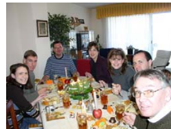
The Spain Missionaries share Thanksgiving Dinner together.

More than anything, we want to share with him a special package. We want him (and many others in Alpedrete) to know the joy and peace that come from knowing Jesus as a true person, not just a small part of the nativity scene each Christmas. No package could be worth more to the people of Alpedrete than the one that came wrapped in swaddling clothes over two thousand years ago. Help us pray that this Christmas season will give us many opportunities to share this precious gift with them. (Their Mailing address is- C/Alpes, 26 28430 Alpedrete (Madrid) SPAIN)