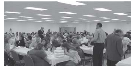
The recently completed Dining Hall has a state of the art kitchen with abundant room for everyone to enjoy fellowship at the same time.

The morning service was followed by a great fellowship meal in the recently completed Fellowship room. After everyone had an opportunity to tour the Facilities, the singing group "High Calling" gave a 30 minute concert before the Dedication Service featuring the dedication message by Attorney Matthew Henderson. The dedication concluded with recognition of those who had helped make this day possible and a slide presentation showing the different phases of the construction of the building.