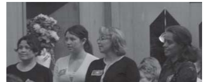
Special guests were 4 students from the Gwen Hendrix Hispanic Institute.

Saturday morning's services featured great special music and wonderful messages from 4 ladies sharing how God worked in the Spring, Summer, Fall, and Winter of your life. At the end of the messages the altar was full of ladies weeping and praying as God moved in a mighty way. The service concluded with the announcement that the wonderful Free Will Baptist ladies of South Carolina had surpassed their goal of raising $10,000 for the Gwen Hendrix Hispanic Institute by collecting over $14,000- Glory!