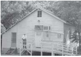
Pastor Nichols in front of the old Church.

Faith FWB Church, Smyrna , is in the process of relocating. They have purchased 2 acres of land at the junction of Highways 5 and 55 in Cherokee County and are in the process of converting an old house on the property into a temporary worship building until they can build a permanent structure. Rev. Marshall Nichols is the Pastor of this growing flock.