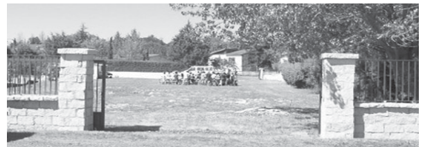
Believers gather to pray on the land for the site of the Villalba Church in Spain.

Good News from Spain: The Villalba Church received some good news recently. As many of you know, the mayor's office of Galapagar decided to appeal (again) the decision to give the church a license to build. After meeting with our lawyer, they decided to drop the appeal. Now our architect will meet with the city officials to present the plans and seek approval. Please pray that everything goes well and there are no more delays in this long-awaited building project.