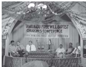
The theme for the South India Bible Conference was "Witnessing for Christ in spite of Persecution"