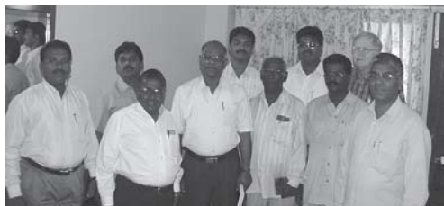
South India Pastors meet with State Moderator, Sherwood Lee before the South India Conference