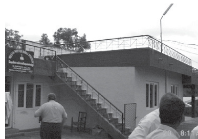
The Volena Wilson Bible Institute