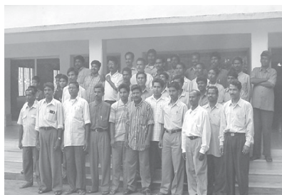
Evangelist and Church planters in North India take a break from their intense Bible study and soul winning courses