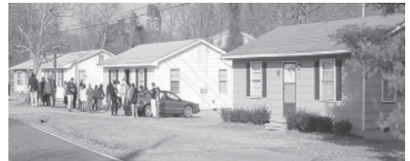
Hispanic Institute Dorm Homes across the street from the First FWB Church, Inman.

The services concluded as everyone toured the dorm homes provided by the First FWB Church of Inman. These home are beautifully decorated and furnished with the appliances needed by the students. In order to furnish these home the Home Mission department borrowed $19,000 counting on the fact that the South Carolina Women Active for Christ have a project this year of raising the needed money for this important ministry.