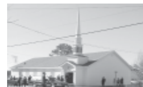
Hope FWB Church

Pray for the family during this time of lost and pray for the Church as they seek God's directions about their future leadership.