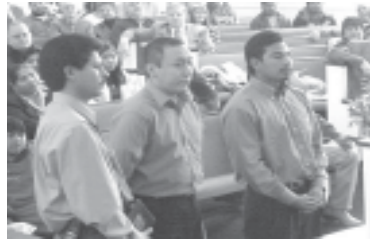
The First 3 Students

Services began in the Fellowship Building with a delicious “Fiesta” of traditional Mexican food prepared by the members of the Community Hispanic FWB Church of Una. Then everyone adjourned to the church sanctuary for the dedication service. All of the Pastors and their wives were recognized as well as the members of their church who attended. A letter was read from Governor Mark Sanford expressing appreciation for the Hispanic Institute and other local government officials were recognized.