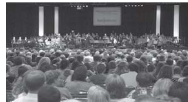
Part of Wednesday Night Congregation

5,476 people registered for the 68th annual Free Will Baptist national convention which met in Kansas City July 18-22. The singing was wonderful. The preaching was great. The business went smoothly. Everyone who has given an opinion so far has given a positive pat on the back to this year's meeting.