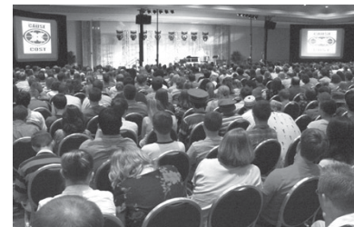
Tuesday Night Teen Worship Service

Adjourned . . . by 10:30 a.m. on Thursday to meet in Louisville, Kentucky, for the July 17-21, 2005, session.