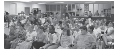
Junior Campers prepare for the Night's worship service