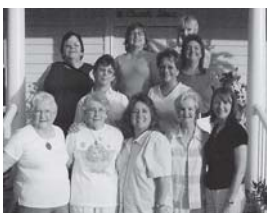
The Ladies Auxiliary of Simpsonville FWB Church recently shared a night out as an activity