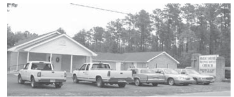
Sweet Home FWB Church