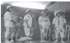
These “Birds” flew in from Low Country FWB Church

The Ladies have done it again! Around 225 ladies gathered at Look-up Lodge on Friday, September 5th for their annual WAC Retreat. Friday night was a time of fun and fellowship as ladies came dressed in Bird attire to go with this year’s theme of “Believers In Christ Rejoicing Daily”. Games, songs, and a time to “Rock the Robin” showed