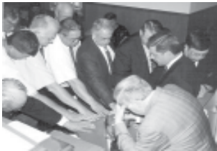
A sacred time as a Minster is set apart for God’s Work.