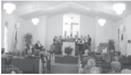
The Newly reworked Sanctuary

The Spirit of the Lord almost crackled in the air as the congregation of First Free Will Baptist Church of Myrtle Beach came together for their annual Home Coming services. What made this day so special was that people entered the church to see a “New” Sanctuary with new carpet and pews that had been installed during the previous week.