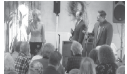
"8th Day" praise the Lord in Song before the Message.

A delicious meal followed as everyone rejoiced in God's continued blessings on this vital ministry in our state.