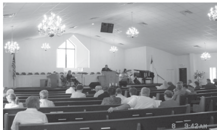
Inside Una's new Sanctuary

In addition to the beautiful new Sanctuary (That is large enough to place the entire old church building inside!), the facility also has several class room, rest rooms, and office space. Pastor Ken Cash now looks forward to the day this new church is just as full as the old church used to be.