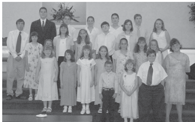
Contestants at the Recent State Youth Conference Meeting