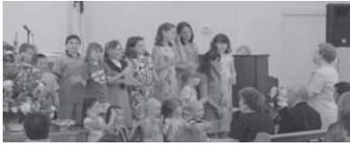
The Youth Choir sing out for Jesus.

Former members, family, and friends packed the sanctuary as the congregation of Southside FWB Church in Darlington met on Sunday, April 27th for their 50th Anniversary - Home Coming celebration. A very interesting Sunday School lesson was presented before the church met to celebrate this special day in their history. The church's past was represented by special music from the Senior Choir, its present was represented by the regular choir, and its future was displayed in specials by the children's choir.