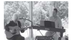
An 84 years young lady provides special music

land behind the church for the glory of God so they began clearing the land and preparing it to be used for singings, special meetings, and camping. The 30 by 60 shelter is completely paid for (largely due to the special offering taken up by the young people of the Church each week) and work is progressing on landscaping the grounds and completing the access road (which will be named "Gandy Lane" for one of the most faithful members of the Church). This is just another way Free Will Baptists are using every means they can to reach their community for the Lord.