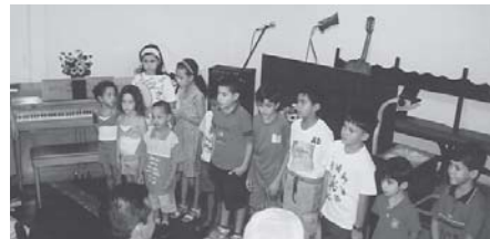
Marincek FWB Church Youth sing about the Lord.