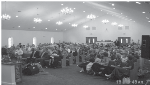
Inside the New Church

May 12, 1996 was when it all began. 38 people decided to leave the church they had been attending and begin a new work for God. They called this church, Liberty FWB Church , Lancaster, SC.