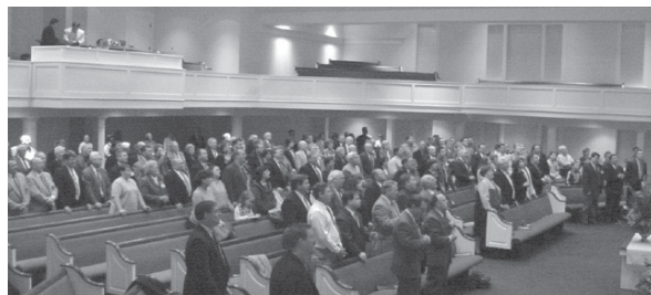
Ministers and Delegates enjoy the new Sanctuary at Peace FWB Church, Florence, SC.