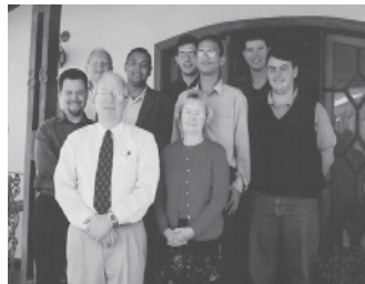
Students and Staff of the Barbacena Bible Institute after the Executive Secretary had taught a class