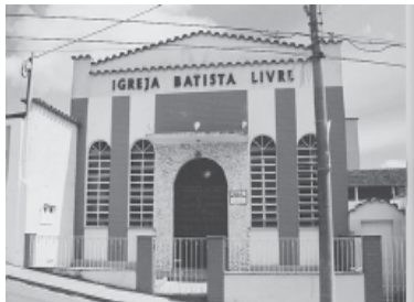
First FWB Church of Barbacena

Pray for and support our Team in Brazil. They carry a big burden (Church planting, Seminary Training, Children's Home Ministry, Youth Camp Ministry, etc) and they have a great opportunity to reach the great people of Brazil.