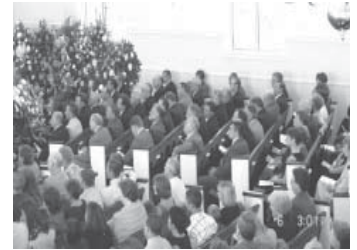
Row after Row of Ministers came to Honor this great worker.