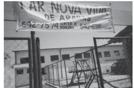
The New Life Children's Home in Araras that a group from South Carolina went to Brazil to work on in 2001