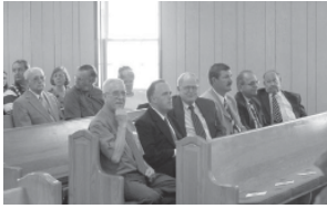
Ministers: Honorary Pall Bearers

occupies was constructed on 2 lots of land donated by Rev. Noles. Later an addition was built onto the back of the church for Sunday School Rooms and rest rooms. Then, as the Church grew, a fellowship building was built behind the Church and eventually a drive thru covered walk way was added. The Fellowship Building also contained more rest rooms and the baptismal pool. And, praise be to the name of the Lord, all the buildings and land are completely paid for.