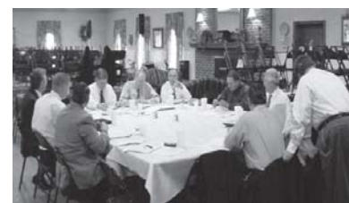
State Executive Committee at Work

Following two days of intense efforts by the SCFWB General Board; and many hours of behind the scene work by the various boards and committees, a revised SCFWB Constitution is being presented to the state for its approval. As soon as the latest corrections and revisions can be incorporated and the revised document can be returned from the printer then it will begin to be distributed to the churches and pastors. Hopefully, this will be before the next round of Conference meetings so people will be able to raise any questions they may have with their General Board representative from their conference.