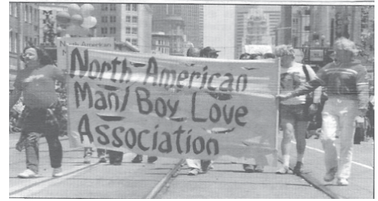
NAMBLA members march in a "Gay Pride" parade. They are campaigning to legalize pedophilia and remove other laws prohibiting adult-child sex.