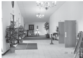
The New Vestibule Area of Westgate FWB Church

Sunday School rooms, Rest Rooms, and office space surround the Sanctuary and let everyone know that the Center of their work