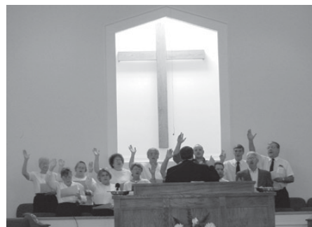
The Praise and Worship Team lead in Dedication of their new facility.

Praise the Lord for this new facility on a main road, only a few short blocks from one of the main malls in Spartanburg. What an opportunity they have to make a mark for Christ in this community.