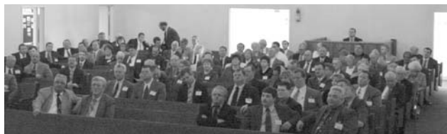
Thursday Business Session

Withdrawing fellowship from a conference or church means that they cannot be seated at the State Association meeting; thus they will have no voting privileges nor can their ministers or delegates serve on boards of the State Association during the breach of fellowship. If they maintain this policy four months after action by the State Association, they will no longer be considered a part of the South Carolina State Association of Free Will Baptists.