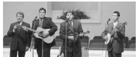
New Covenant Singers