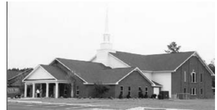
Peace FWB Church, Florence