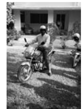
The Thursday Night Offering raised enough to purchase a motor Bike for a Pastor in India- Glory!