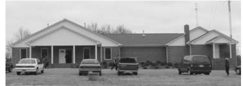
Simpsonville First FWB Church. New Sanctuary is on the Left.