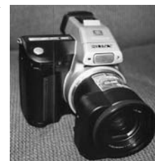
Temple FWB Church gave the State Promotional Office the funds for a new Digital Camera. GLORY!