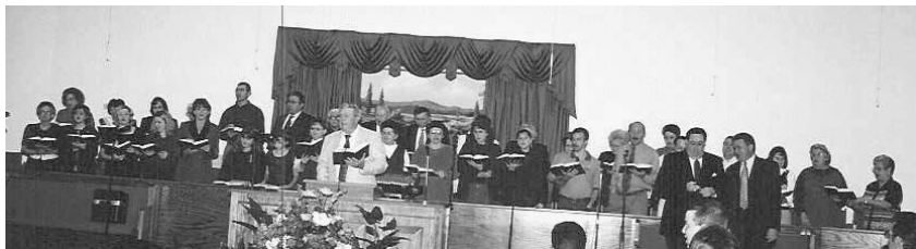
The Mass Choir of First FWB Church, Chester helped make Carolina Camp Meeting another Great success this year.

ROLL CALL SUNDAY- EASTER SUNDAY, MARCH 31, 2002. Make your Plans for your biggest day ever!