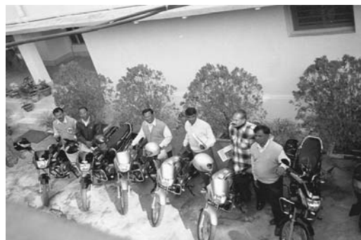
Proud Pastors in India show off the new Motor Bikes purchased by South Carolina Churches