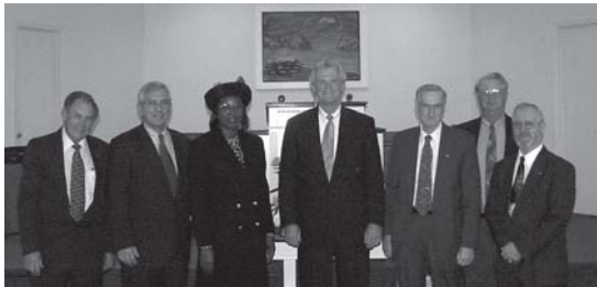
The Deed to 1.08 acres of land is presented to the Trustees and Pastors of Immanuel by officers from Lakeland Investors

Be heard, cry out, and mount an assault on the evil being taught to our children. Flood the schools with gospel tracts that clearly show God's teaching against this wicked sin. Students cannot be forbidden to give out tracts to fellow students. Let's be heard. We have God's message. Let's suffer for Christ's sake. To God be the glory!!! AMEN!!!