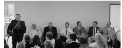
Local Pastors and members assist in the mortgage burning service.

2) Mortgage Burning on Fellowship Building. Immediately following this service the congregation adjourned to the nearby fellowship building for a great meal and a time of fellowship before the mortgage was burnt on this new building