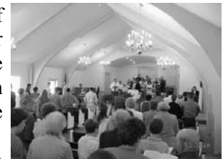
Grace FWB Church spacious new Sanctuary

Grace FWB Church , Lake City celebrated the renovation of their Sanctuary on Easter Sunday. A Baptistry, a New Choir loft and Pulpit area, and new rest rooms were added to the end of the Church. Then everything was changed from varnish to bright white paint. New carpet and new pews were also added. Now it looks like a brand new Church.