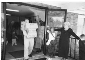
Pasta-a- plenty is loaded in the CH Van