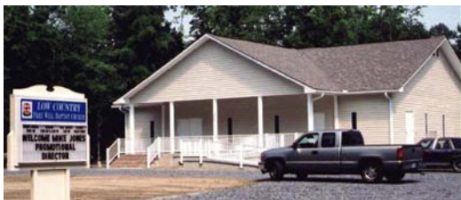
Low Country FWB Church