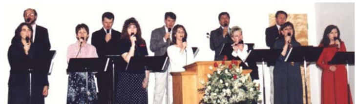
The Tremendously Talented PRAISE TEAM of West Side F.W.B. Church blessed hearts with their music.