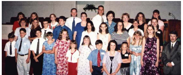
Beaver Creek Conference CTS Contestants and Sponsors