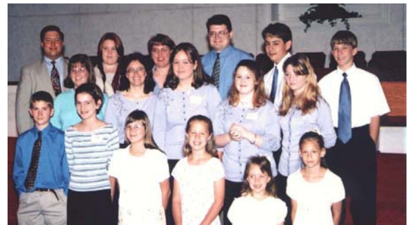
S C Conference CTS Contestants and Sponsors