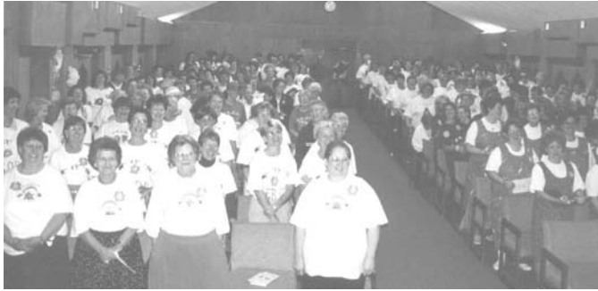
Part of the over 300 ladies who attended the WAC ladies Retreat at Lookup Lodge Sept 29-30. I won't tell you WHY THEY ARE STANDING but their Pastors should get a very good altar call response if he preaches on GOSSIP.