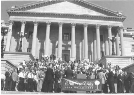
Free Will Baptist join with other Pastors at our State Capitol in standing against the Lottery.

VOTE NO on the LOTTERY issue on Nov 7 th . EVERY religious group in South Carolina has made a stand against the Lottery. Only the Governor and the gamblers are for it. Honor God by standing for the right- - and against the Lottery.