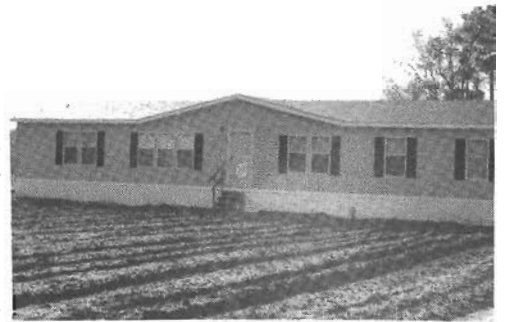
2434 Allen Road. Home of the Promotional Director and His Princess .

My wife and I love where we live; but, as you can see, our mobile home sits in the middle of a plowed field. One rainy Saturday we returned home