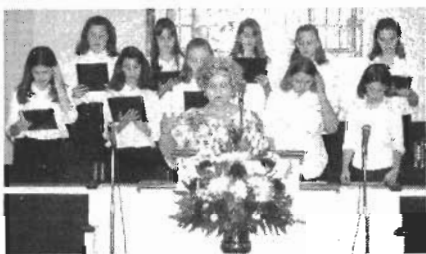
The Youth Choir of Black River FWB Church provided special music.